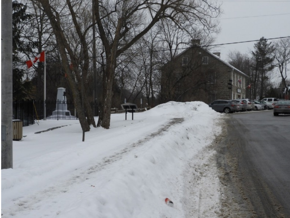
Sidewalk on Dickinson St towards the Mill ends at the Memorial forcing pedestrians to use the road jumping over a snow bank