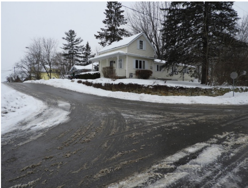
Corner of Currier and Dickinson where there is no stop or yield sign to slow traffic.