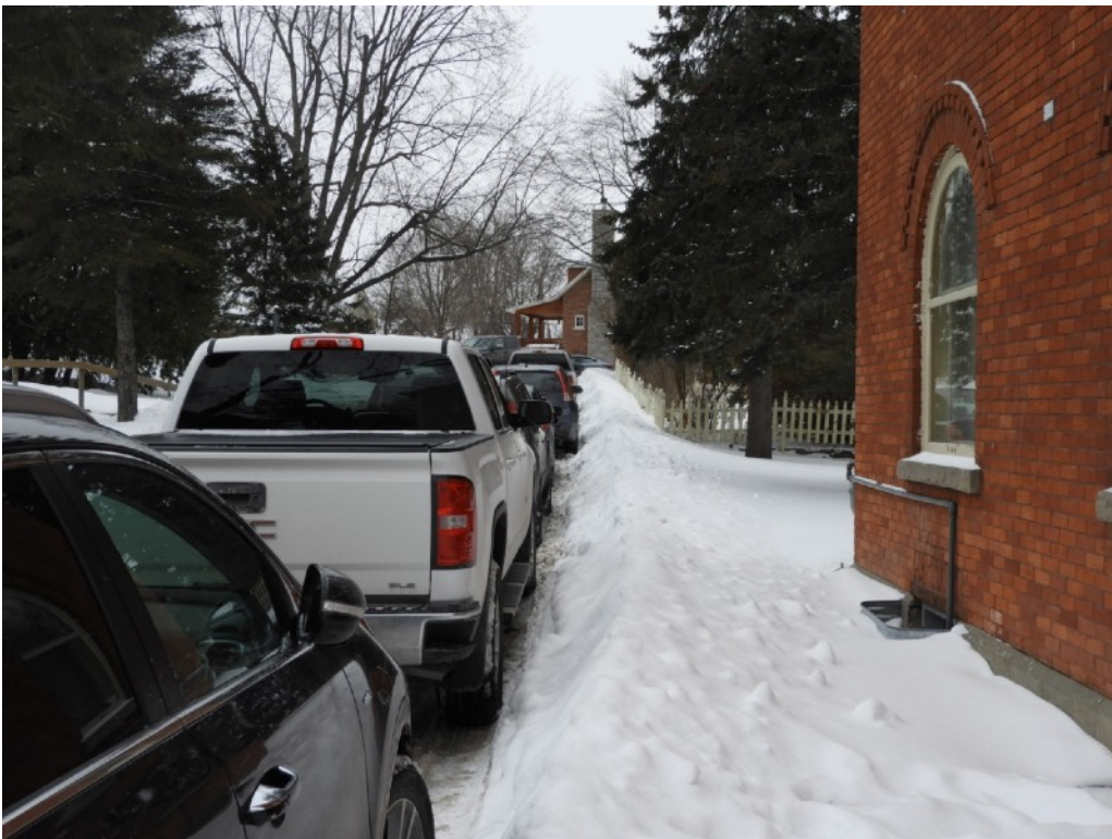
Dickinson St between Mill and Tighe Streets. Sidewalk is buried and has never been shovelled.