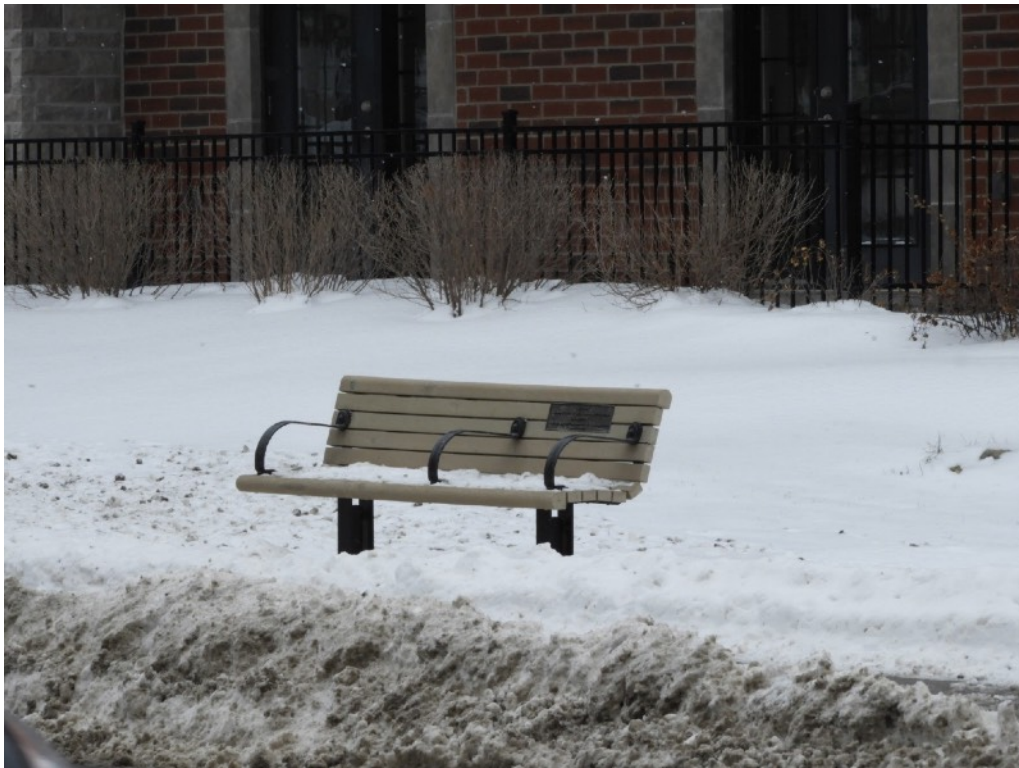
One of three benches on the route which is snow covered