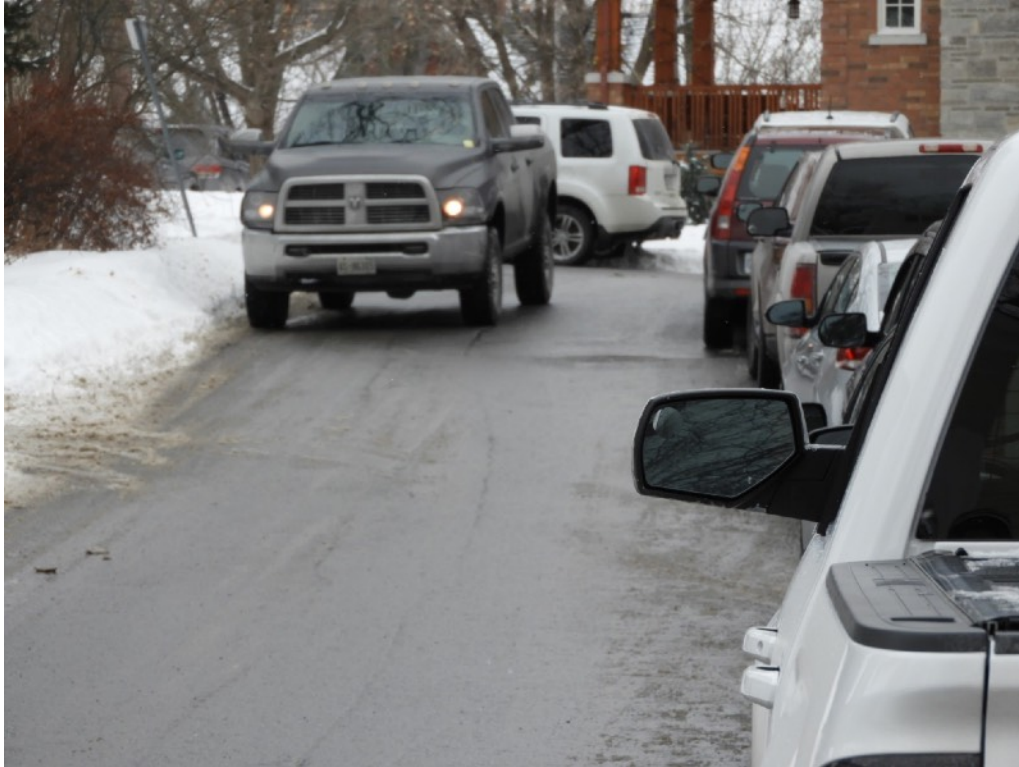
Walking on Dickinson between Mill and Tighe Streets is hazardous. Brave pedestrians have to dart in between cars to avoid being hit.