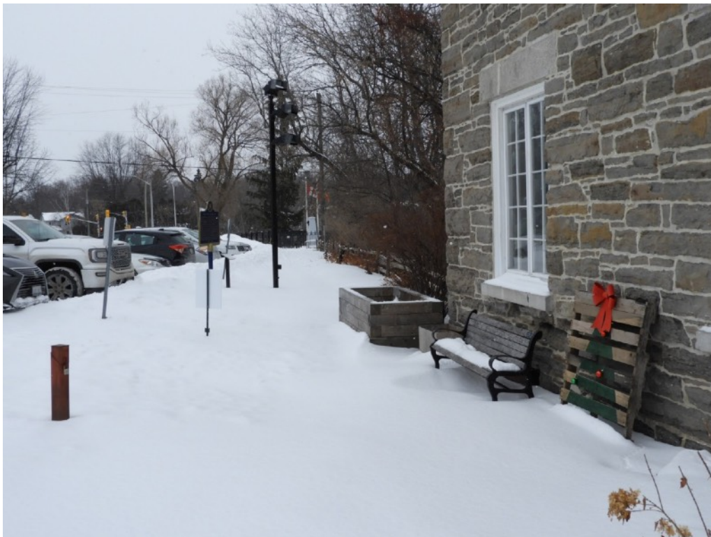
The sidewalk in front of the Mill is not shovelled forcing pedestrians to use the road