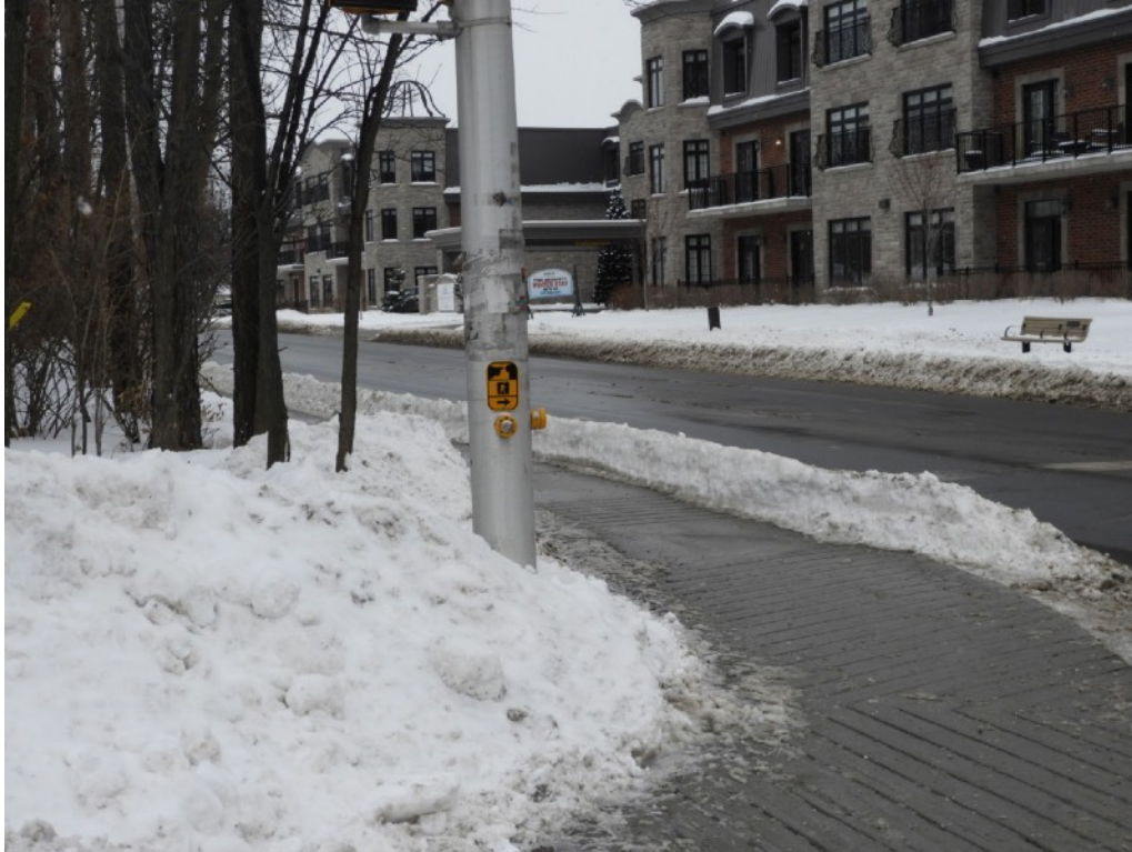
Traffic signal light is not accessible