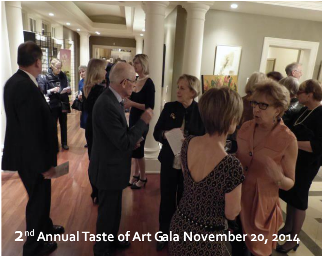
2 nd Annual Taste of Art Gala November 20, 2014