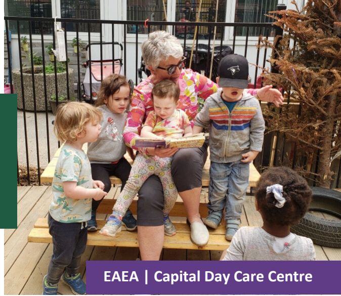
EAEA | Capital Day Care Centre

"For the past 7 years, I have volunteered at the COA in various capacities, with events, registration, database, and serving on a committee. Though retired, it was wonderful to be still able to contribute and feel my efforts made a difference."