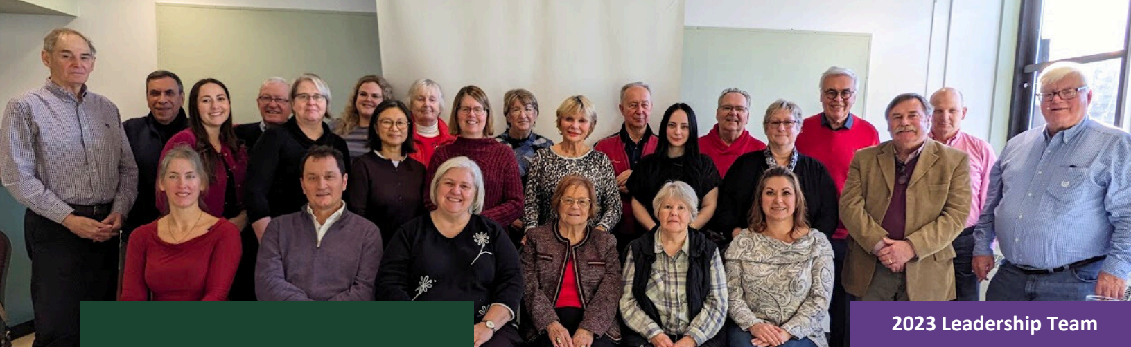
2023 Leadership Team