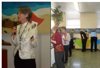
International Women's Day