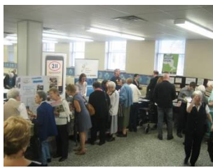
Annual Francophone Forum