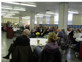
Lunch n' Learns