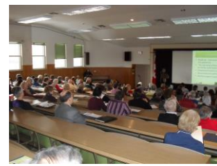
Conference on Aging & Spirituality